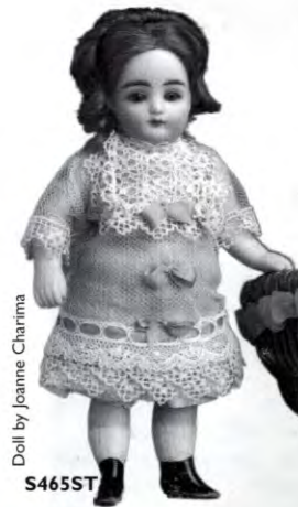
Doll by Joanne Charima

(see BB6.55 compo body section to see same style pattern: L13408 )