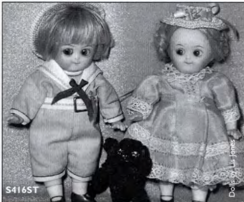
Dolls by Lis Jones

CP943 Dress, tulle overdress, chemise and drawers pattern. (shown on doll)