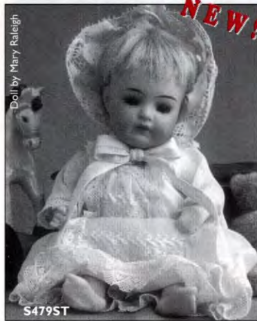
Doll by Mary Raleigh

CP942 Crocheted hat, dress, cape (shown on doll)